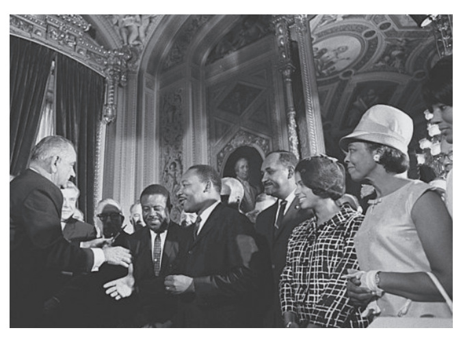
President Lyndon B. Johnson meets with Martin Luther King, Jr. at the signing of the Voting Rights Act of 1965.

As we talk about 'Where do we go from here?' we must honestly face the fact that the movement must address itself to the question of restructuring the whole of American society. There are 40 million poor people here, and one day we must ask the question, 'Why are there 40 million poor people in America?' And when you begin to ask that question, you are raising a question about the economic system, about a broader distribution of wealth." — MLK, Jr.